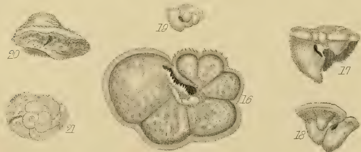
Gen. Pulvinulina .